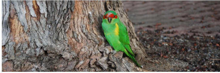
Fig. 1. A figure which spans two columns must be placed either at the top of a page or at the bottom of a page. Figure caption with more than one line must be justified. Figure caption with only one line must be centered.